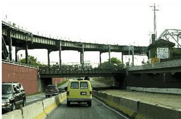
The Sheridan Expressway today

The Sheridan Expressway cuts through largely Hispanic and African American neighborhoods, separating them from each other and the Bronx River. The area has significantly lower than average household income and car ownership rates. It also has some of the highest asthma rates in the entire state. South Bronx neighborhoods have twice the average asthma hospitalization rate of New York City, and 10 times the state rate. Sheridan area neighborhoods are also sorely lacking in open space, with less than 1/2 acre per 1,000 residents – approximately 10 percent of the national average.